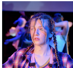
LUCI Young performer