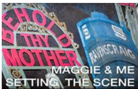
WATCH | MAKING OF MAGGIE & ME | EPISODE 1