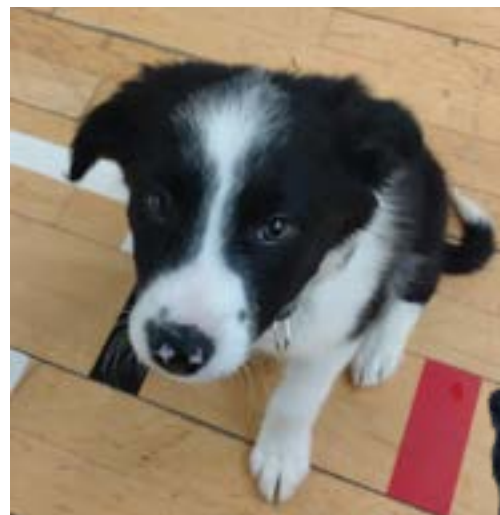
Extreme Cuteness from Day 1