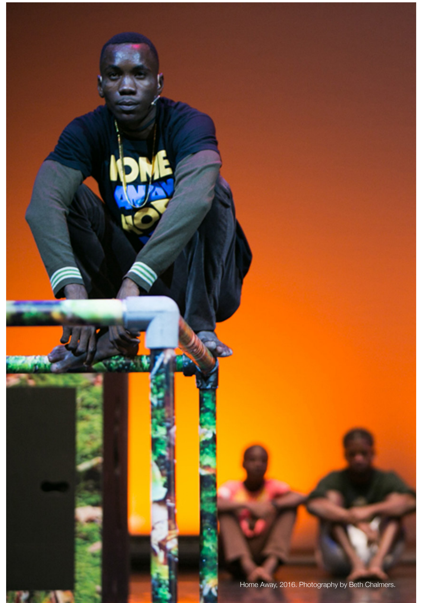
Home Away, 2016.