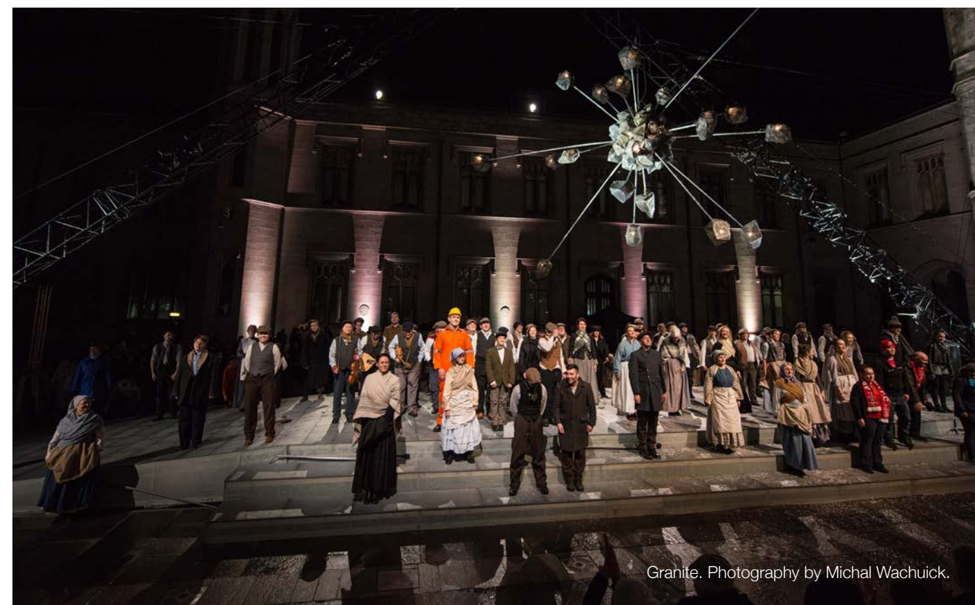
Granite.

Being without walls allows us to define theatre in the broadest and most exciting terms. We have a responsibility to ensure our national theatre finds its relevance to younger audiences, not just for work made with these audiences in mind but also because we will have made classical and traditional theatre forms more exciting. We embrace cross-artform projects, including work with choreography, film, music, visual arts and technology.