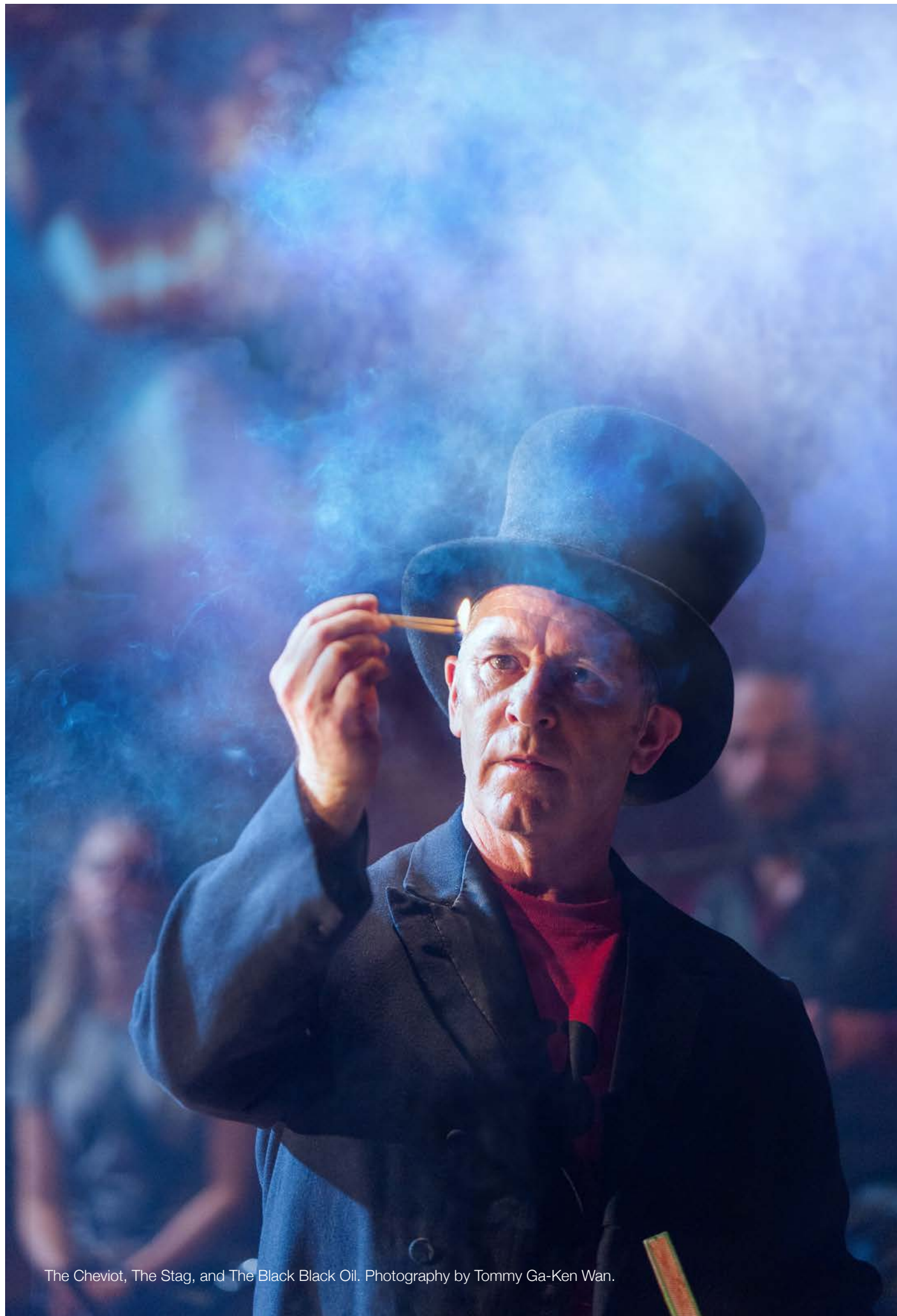
The Cheviot, The Stag, and The Black Black Oil.