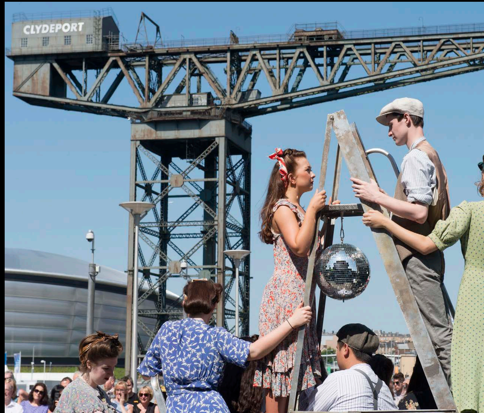
The Tin Forest Clydeside. Photography by Tim Morozzo.