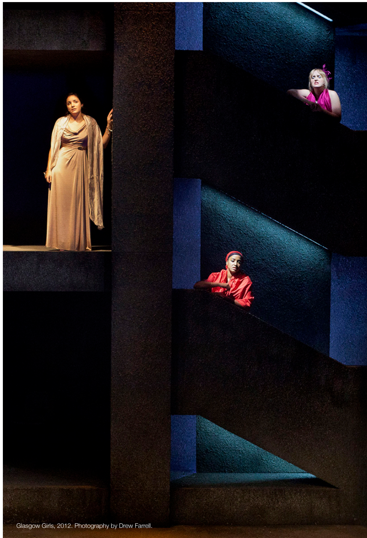
Glasgow Girls, 2012.