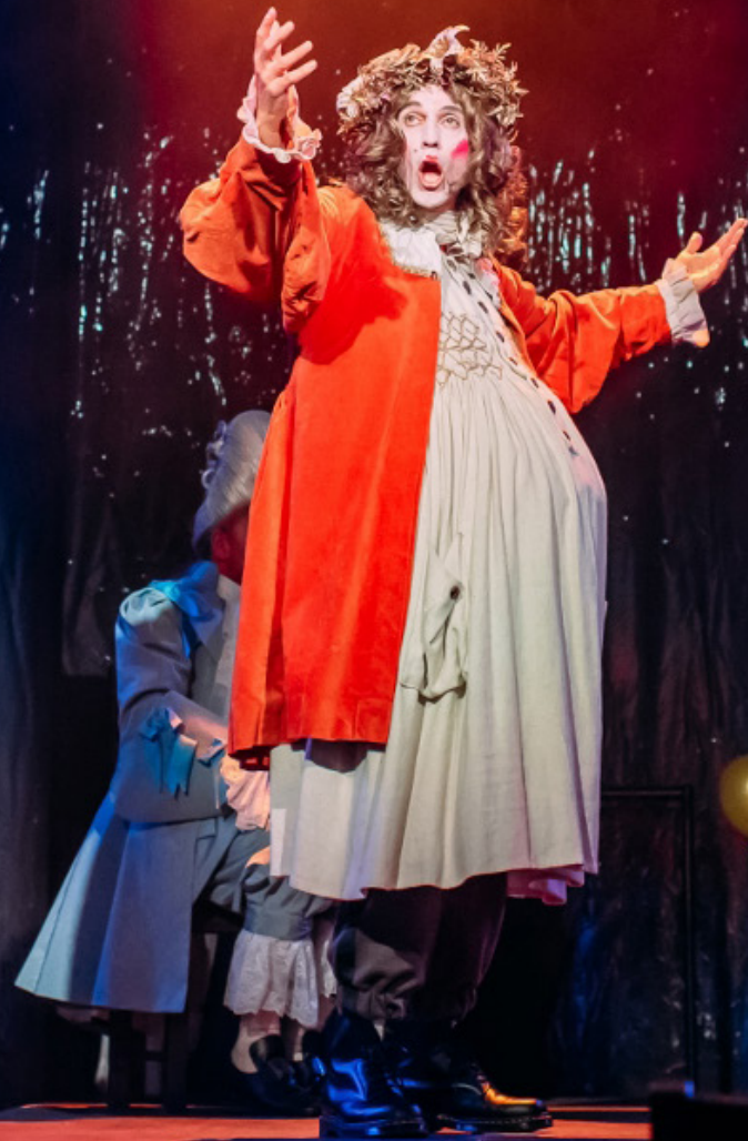
Cyrano de Bergerac.