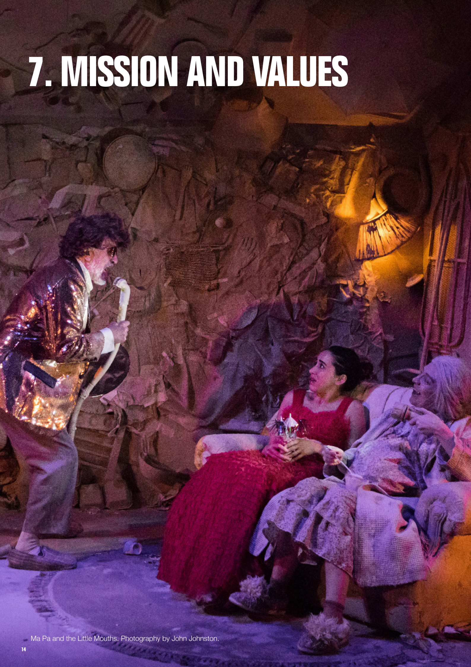
Ma Pa and the Little Mouths.