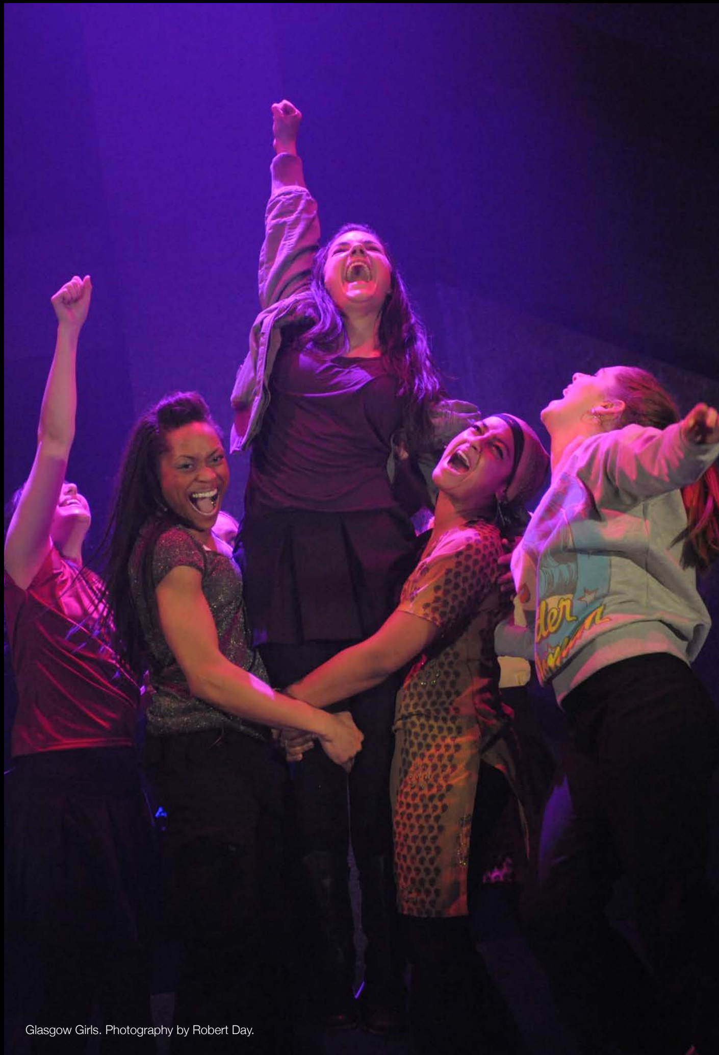
Glasgow Girls.