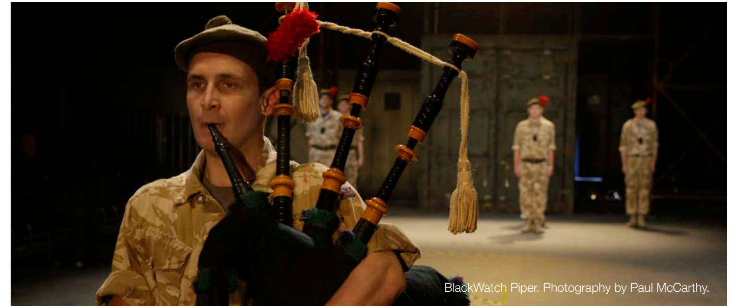
BlackWatch Piper.

When this plan was first written it was in a context of significant political, economic and cultural change and uncertainty. As we re-examine it in mid 2021 that is even more true. Since the plan was first written Brexit has gone from being anticipated to a reality, although its ultimate impact may currently be masked by the enormous and still unfolding impact of the COVID -19 pandemic.