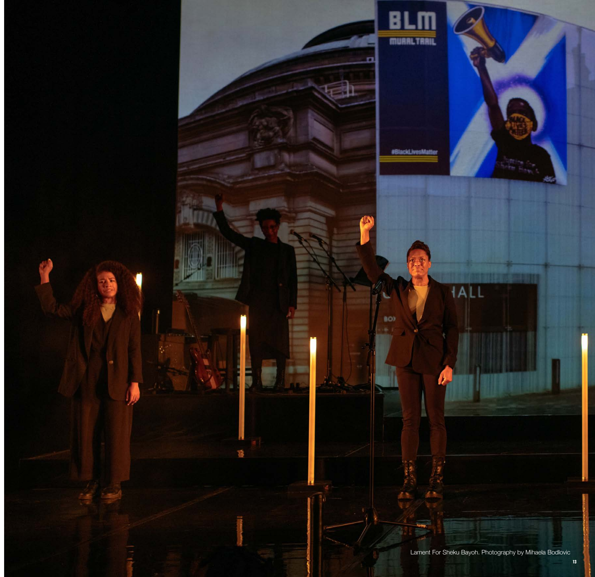
Lament For Sheku Bayoh.