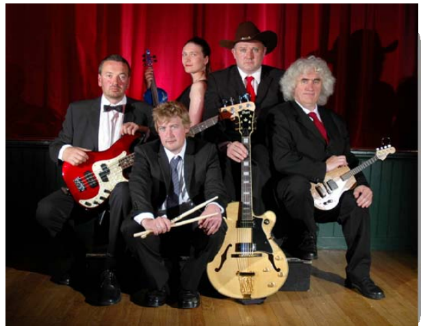
The Lone Star Swing Band